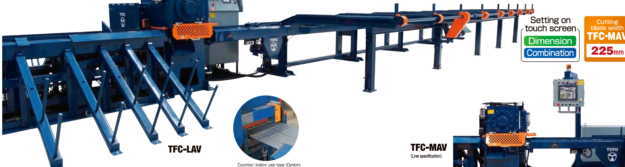
TFC-MAV (Line specification)